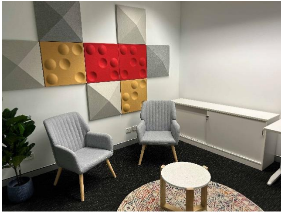
Consulting Room 1 (15m2)