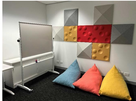
Consulting Room 2 (family)