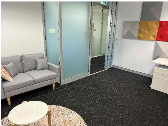
Consulting room 3 (20m2)